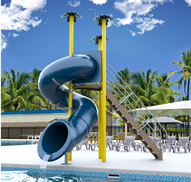
*Palm tree toppers are not included and available for additional cost

Single flume triangle deck poolside slide features a single 360° enclosed slide flume, a triangle deck, and center steps with rails. The slide flume is fabricated from rotationally molded UV stabilized color impregnated LDPE. Custom colors are available.