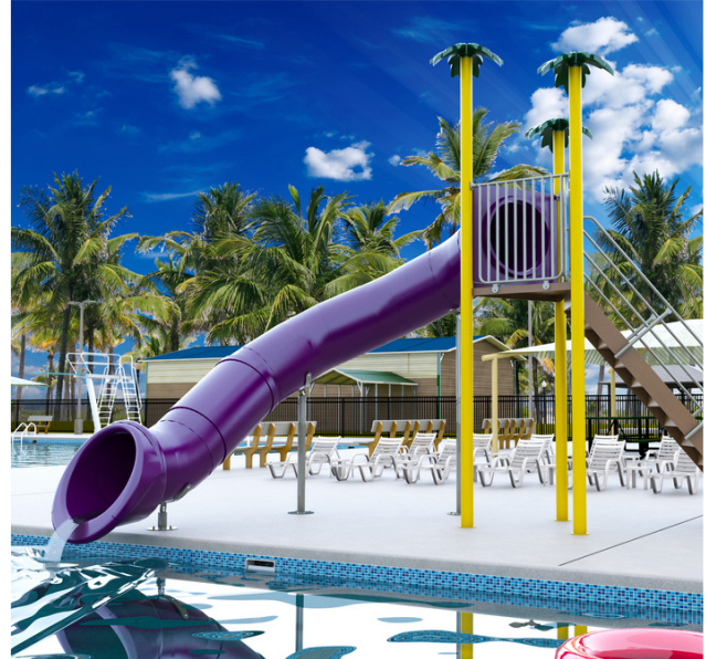
*Palm tree toppers are not included and available for additional cost

1810371 - SINGLE FLUME 360° TRIANGLE DECK